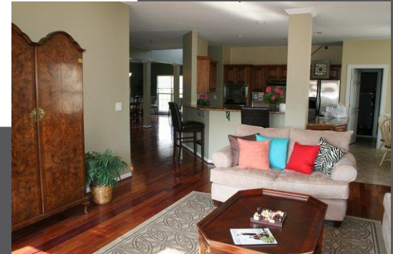
The living room